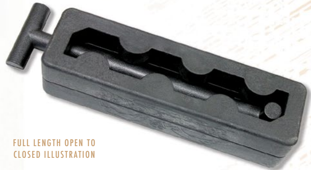
FULL LENGTH OPEN TO CLOSED ILLUSTRATION