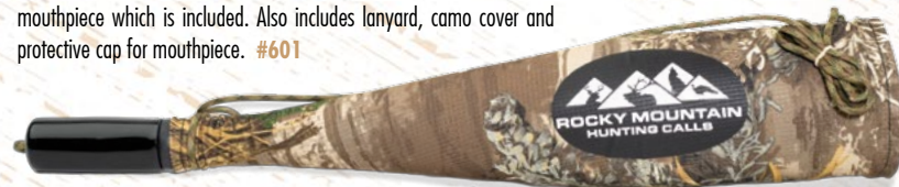
MOUTH OPENING: 1" / LENGTH: 18 3/4"

A call tube that can be used with your own voice or the external reed type mouthpiece which is included. Also includes lanyard, camo cover and protective cap for mouthpiece. #601