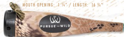
MOUTH OPENING: 1 1/4" / LENGTH: 16 3/4"

The V.E.T.T. system contains a spring tuned to the precise dimensions that is located in the front section of the call. The spring helps create more volume, stabilizes the higher notes, maintains higher pitches and takes less air pressure to operate while blowing into it.